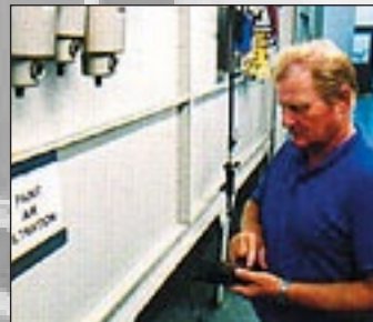
Compressed Air Analysis