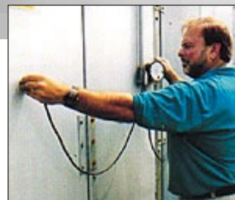
System Surveys and Particle Counts