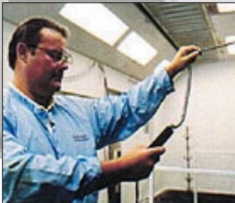
Air Flow Charting and Booth Balancing